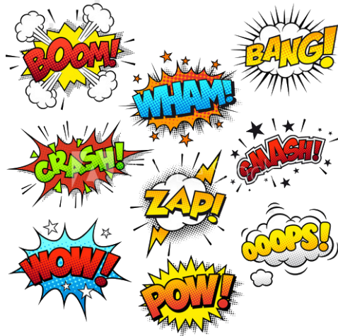
Samples of onomatopoeia mixing text and graphic

The research topic of this thesis will consist in developing strategies to detect, extract and recognize the onomatopoeia, which own variable characteristics in terms of shape, colour and orientation. The main difficulty is that there are many different style of onomatopoeia. Some of them correspond to text mixed with graphic as shown in the following image.